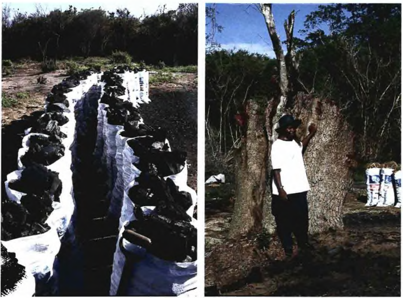
Left A charcoal production line in the Licuati Forest Reserve. Right The stump of a Lebombo wattle, Newtonia hildebrandtii , felled for charcoal production in the Licuati Forest Reserve. Once a sustainable resource, rapid urbanization and rampant poverty is placing pressure on these trees.

heavily, but the thicket itself has been rather inaccessible because of its dense vegetation cover. However, bulk harvesting for the markets in Maputo is placing an increasing demand on the surrounding areas and it is expected that plant harvesting will soon increase within licuati thicket.