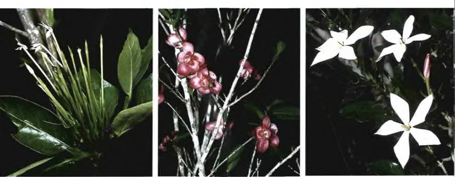
Above left With most unusual flowers, Oxyanthus latifolius is another Maputaland Centre endemic. Above centre Ochna barbosae (sand plane) is common within licuati thicket and is easily identified by its interesting flowers; after shedding their yellow petals, the sepals turn from green to pink, thus assisting in advertising the ripening fruits to birds. Above right Hyperacanthus microphyllus is a beautiful white-flowered endemic tree of the Maputaland Centre of Endemism and is common within licuati thicket. Below Licuati thicket is characterized by dense stands of Psydrax fragrantissima.

occurs in a patchy mosaic with dry woodland. Licuati forest is generally evergreen, with semideciduous trees also occurring, but these species are not dominant. In southern Africa, forests generally show low levels of tree endemism. Licuati forest, however, is an exception in being a forest type rich in endemic plant and animal species. Of the 230 Maputaland Centre endemic plant species. thirty-five are associated with, and twenty restricted to. licuati forest and thicket.